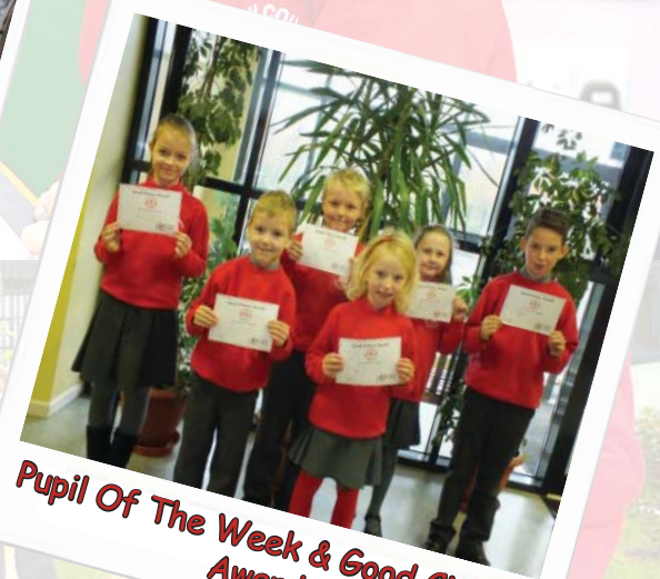
Pupil Of The Week & Good Citizen Awards