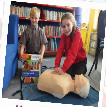
Heartstart Year 7