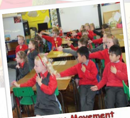
Primary Movement Years 1-3