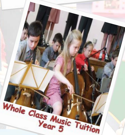
Whole Class Music Tuition Year 5