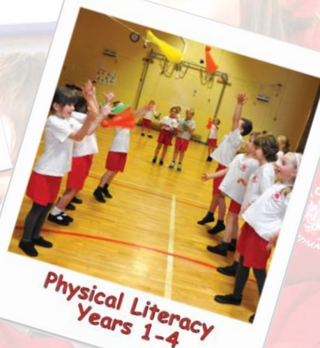
Physical Literacy Years 1-4