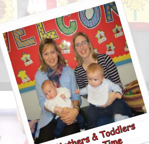
Mothers & Toddlers Rhyme Time