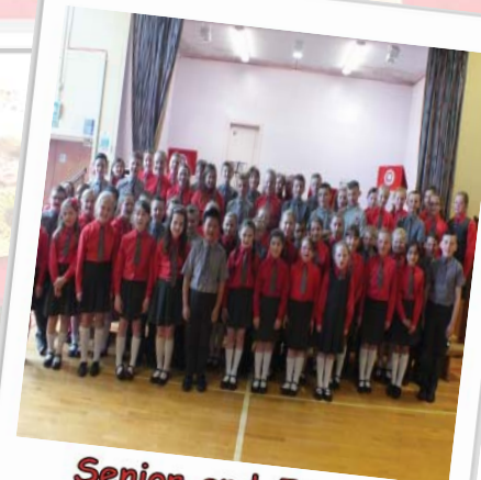
Senior and Junior Choir