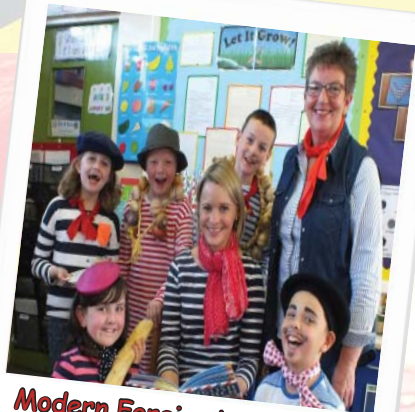
Modern Foreign Languages - Spanish, French and Mandarin